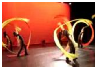
Ribbon Dance – 彩帶舞