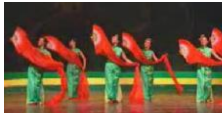
Grant Opening – 開門紅