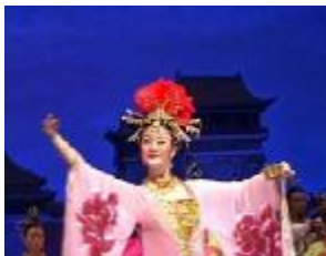
Dance of Tang Dynasty – 夢回大唐