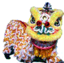
Lion Blessing – 雄獅獻瑞